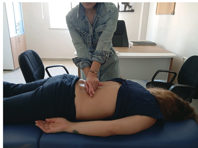
Figure 1. Maitland's PA central vertebral mobilization technique PA: Posteroanterior

Demonstration of the side-lying lumbar spinal manipulation