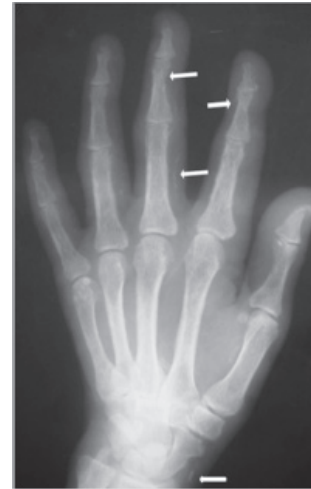
Figure 1. Right hand graphy of one of our case with evident osteopenia. Subperiosteal resorption at radial side of middle phalanges of third finger and radioulnar side of middle phalanges of second finger are present. Interdigital artery calcification at radial side of third phalanges and radial artery calcification at wrist are seen.